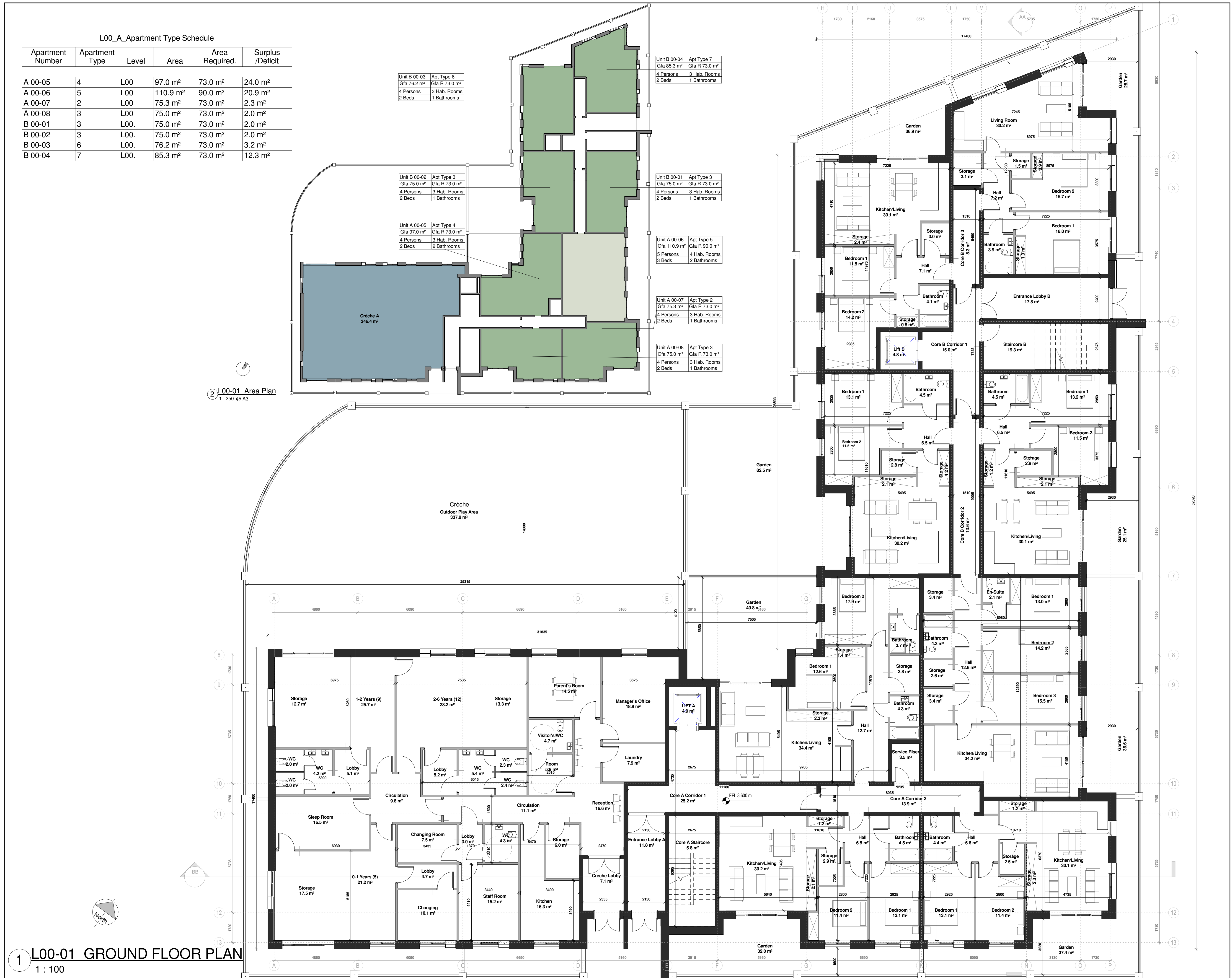
1 L00-01 GROUND FLOOR PLAN 1:100

Notes: DO NOT SCALE FROM THIS DRAWING. USE FIGURED DIMENSIONS IN ALL CASES. VERIFY DIMENSIONS ON SITE AND REPORT ANY DISCREPANCIES TO THE ARCHITECTS IMMEDIATELY. THIS DRAWING TO BE READ IN CONJUNCTION WITH THE ARCHITECTS SPECIFICATION. THIS DRAWING IS COPYRIGHTED AND MAY ONLY BE REPRODUCED WITH THE ARCHITECTS PERMISSION.