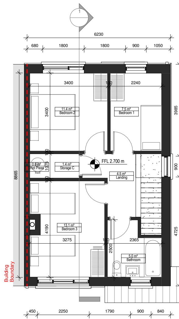
2 01 First Floor Plan 1 : 100 @ A3